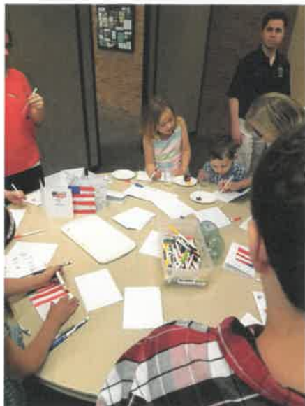
Children from St. Michael's wrote letters to Veterans ...