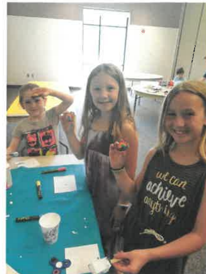
... and painted rainbow rocks for hunger in their Community Service Project.