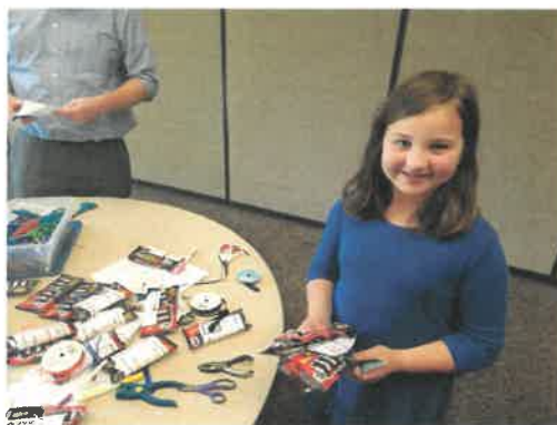
...made treats for mail carriers